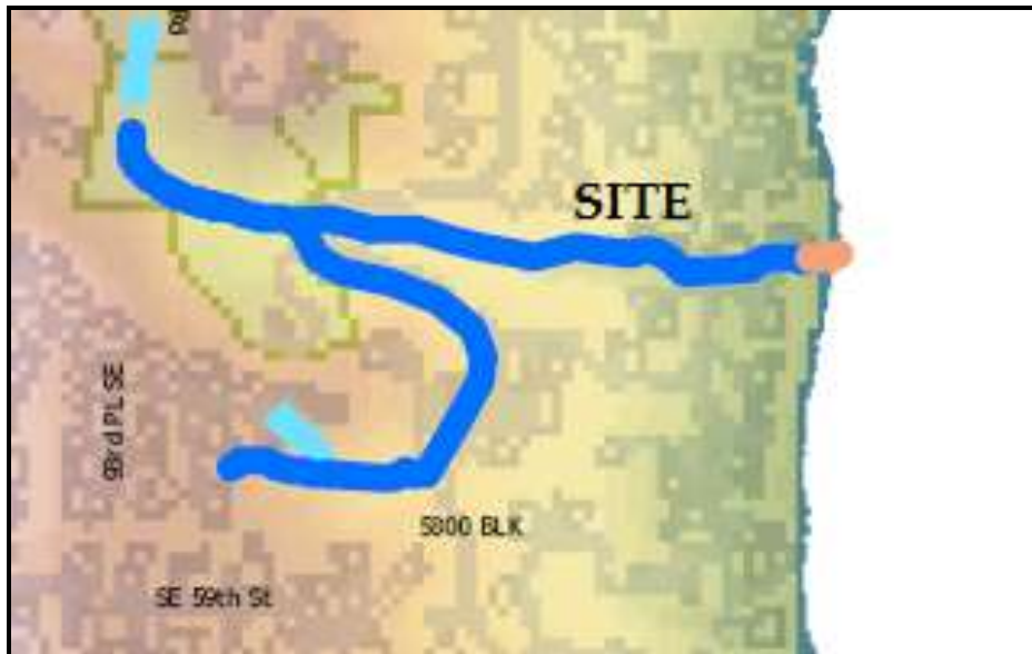
Above: Mercer Island Stream Inventory of the site

The City of Mercer Island stream inventory shows a perennial flowing non-fish bearing stream also known as a Type 2 watercourse with a 50' buffer.