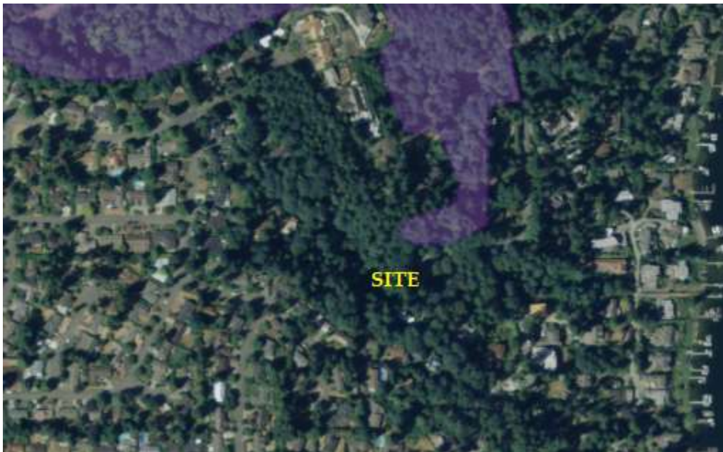
Above: WDFW Priority Habitat mapping of the area of the site.