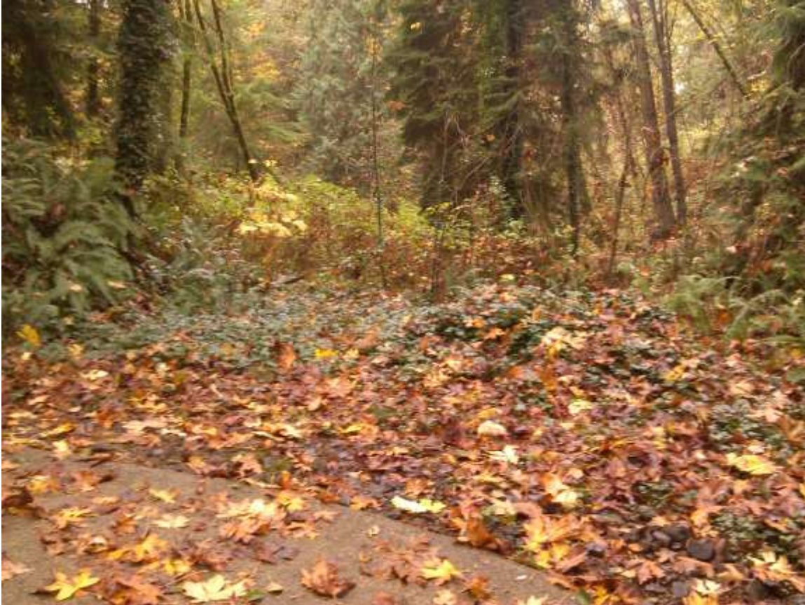
Above: Existing quarry spill access driveway which leads to proposed building site