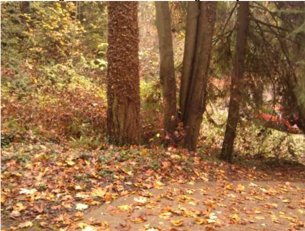
Below: looking north across site near existing driveway entrance