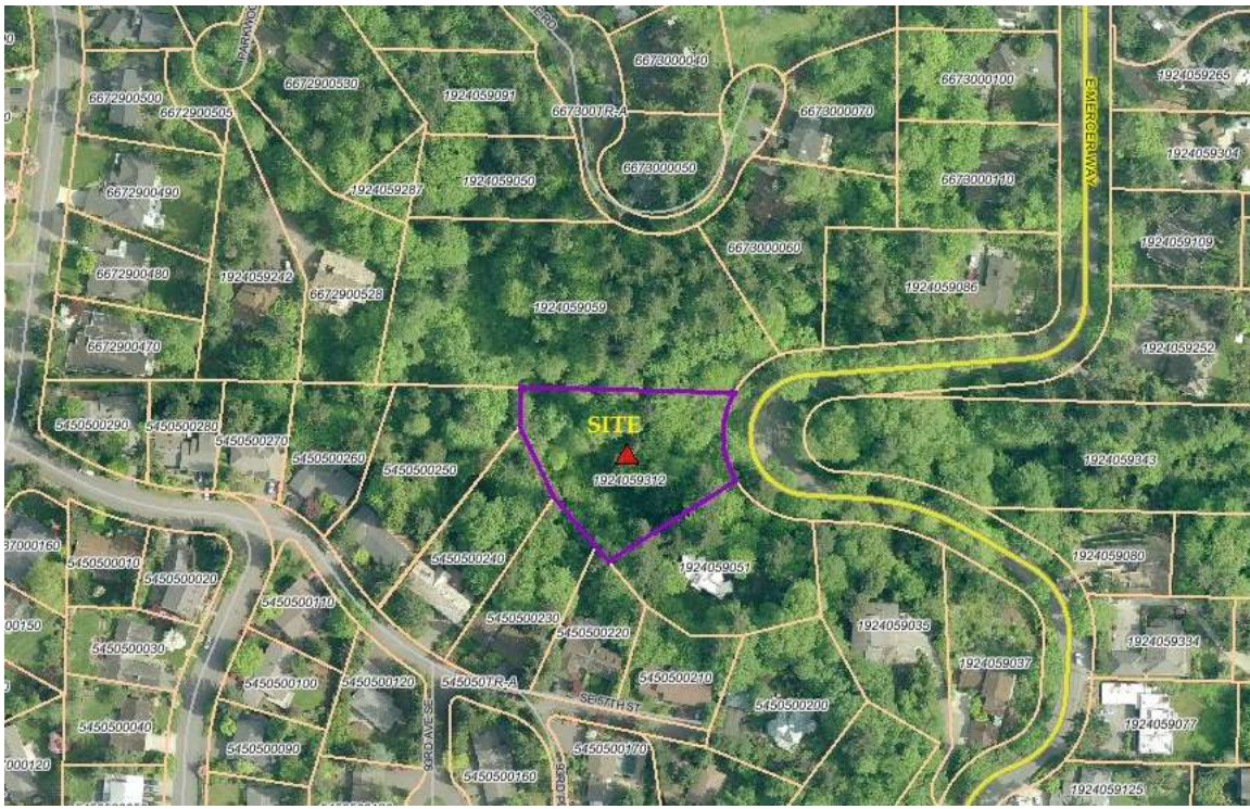
Above and below: Vicinity map of the site.