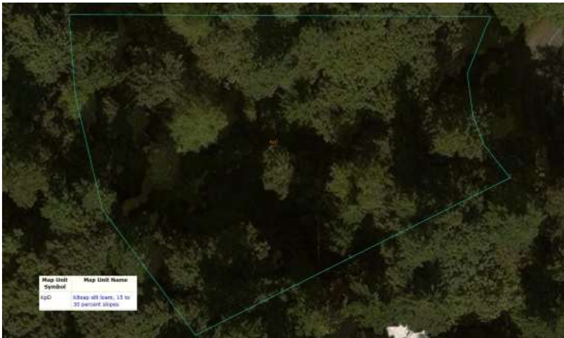
Above: NRCS Soil map of the study area.