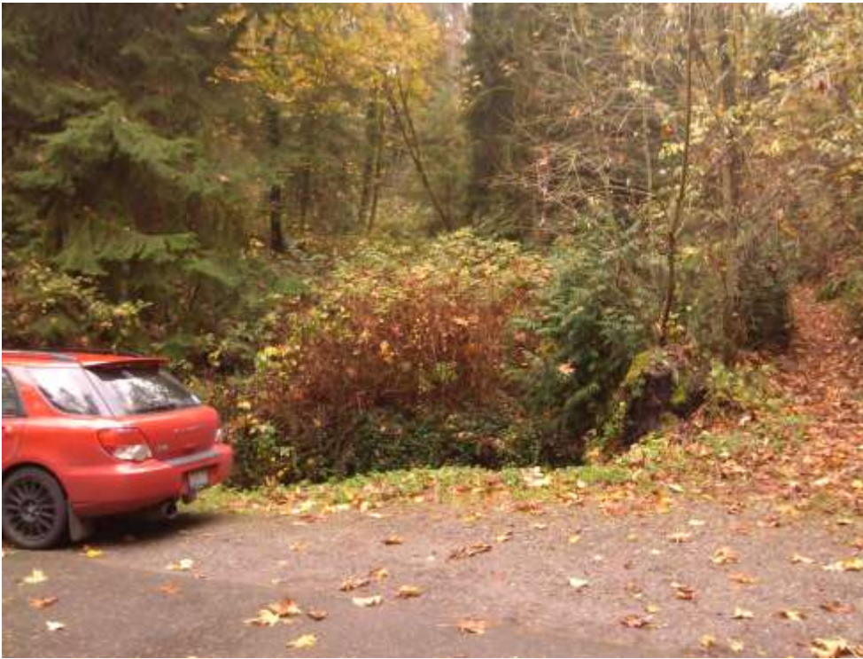
Above: Site as viewed from Mercer Way